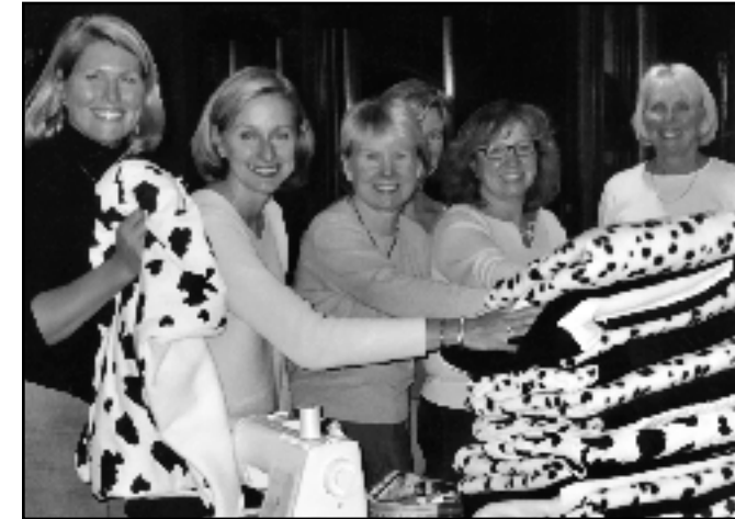
■ Delta Gamma members show off their blankets, which will be donated to families in need.

ROPARD's Children's Low Vision Resource Center came into existence in September 2001 in large part due to the time and effort of many local Delta Gamma alumnae. That initial support has continued, both on local and national levels.